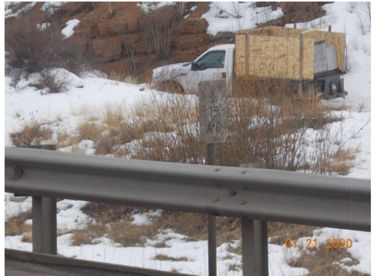
Structure I-15-AO signage.