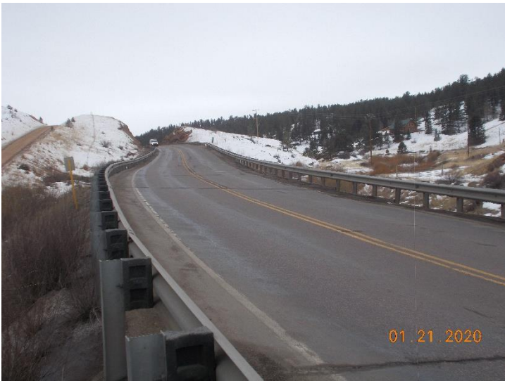
View of bridge I-15-AO looking south.