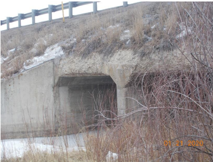
View of bridge I-15-AO from the east side.